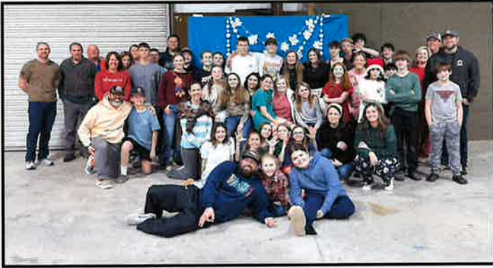
Youth Christmas Party