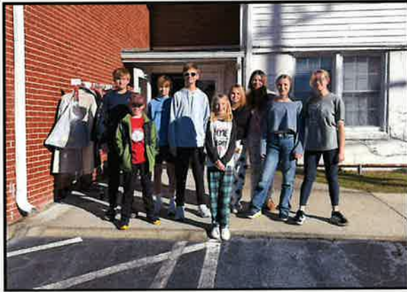
Serving same day as the bonfire

We kicked off January with a youth party in the Wild Game Building for a night of fun, laughter, and community — an exciting way to begin a new year together.