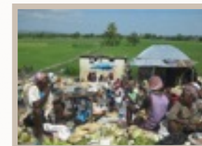
Help make market day easier.