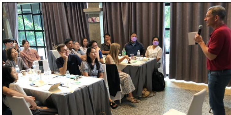
The seminar also included questions and projects for couples and groups.