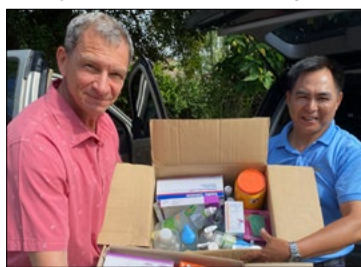
We delivered some medical supplies to a clinic on the Myanmar border.