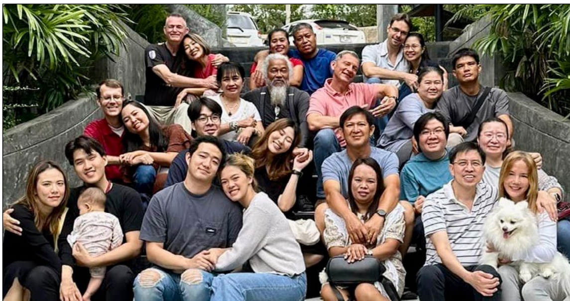
Thirteen couples enjoyed learning about and discussing healthy and unhealthy boundaries in our lives.