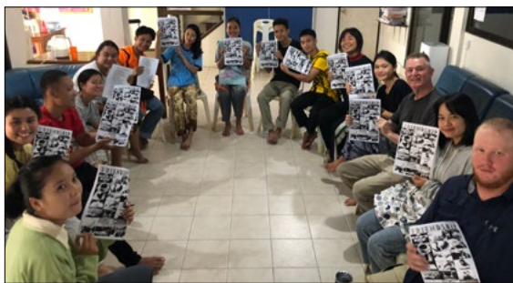
Studying 25 lessons in the Friendship book.