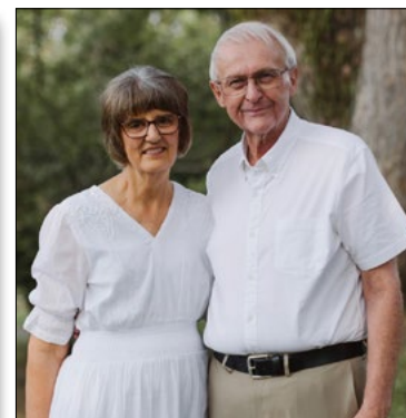
50 years together and still smiling.