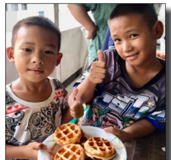
Two thumbs up for the waffles!