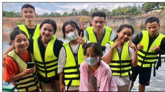
Exciting time swimming at the waterpark.

I always love Friendship Week! The purpose of FW is to move everyone closer to Christ.