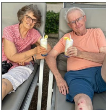
Relaxing by the beach in style.