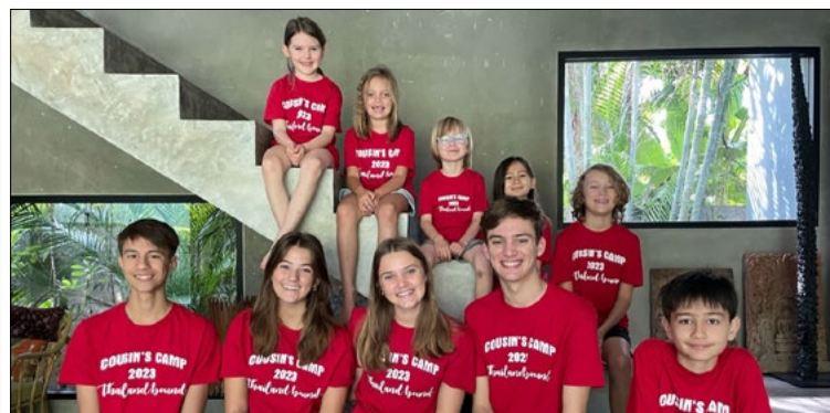
We had the first-ever Cousins Camp outside of Texas.