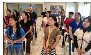
Students worship at PCZ church.