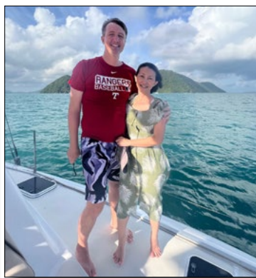
Sailing on a catamaran in beautiful Phuket.