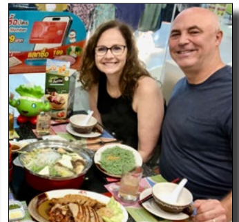
Celebrating their 30th anniversary at MK Restaurant.