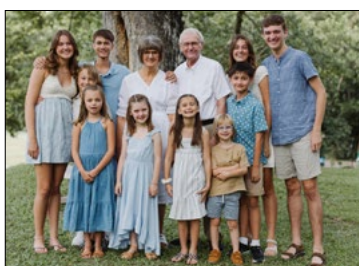
The cousins loved their time here in Chiang Mai.