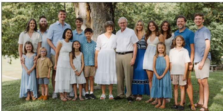
Bouncing around Chiang Mai with 18 people was fun, if not easy.