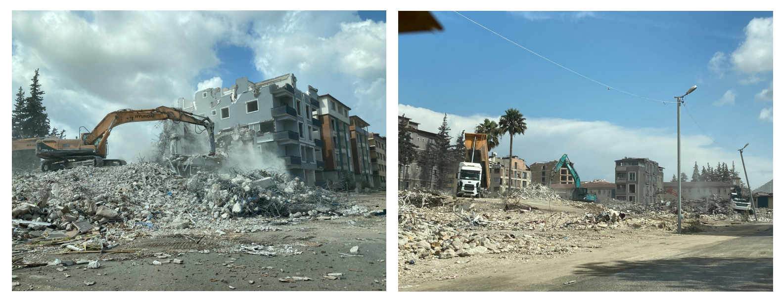
There are still many buildings waiting to be demolished. The ground is covered with rubble and people are trying to live between heavily damaged buildings that may collapse in a small earthquake.

The emotional atmosphere of Antioch, despite our previous experiences, unanticipatedly gripped our hearts. Observing the almost stagnant recovery and tangible despair after a grueling eight months was both heartrending and demoralizing. Voices from the depths of despair shared harrowing realities - estimations of 200,000 lives lost in Antioch alone and a speculated decade before normalcy can caress their days again. The fortunate find shelter in 21m2 (216 ft2) container houses, while others resort to tented living. Amidst the wreckage and precariously standing structures, many attempt to resurrect their businesses in containers, endeavoring to stitch together remnants of normality. Despite some residents seeking refuge elsewhere, the magnetic pull of home has drawn them back; for an Antiochene, Antioch remains their unwavering home.