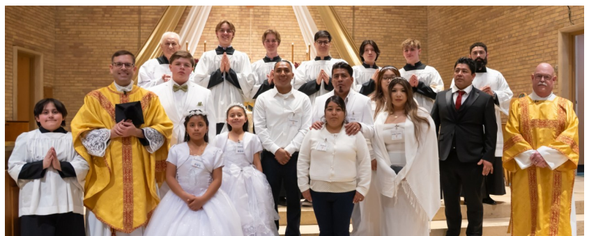
Above: Easter Vigil - Newly Initiated Catholics