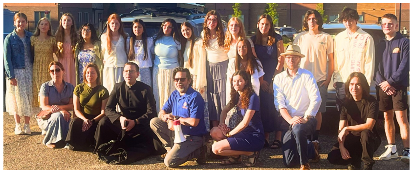
Above: Youth Mission Trip, Below: Confirmation