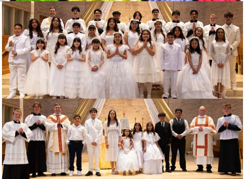
Top 2 Photos: First Communion