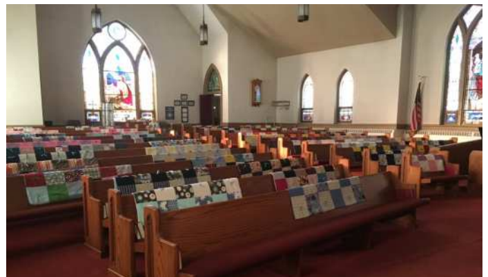
Above: On average, Lutheran World Relief distributes more than 300,000 quilts worldwide each year. Bethlehem's quilters share their work with LWF annually.

We have an industrious group of quilters who meet on the 1st and 3rd Monday mornings of each month to make quilts for the benefit of Lutheran World Relief and Des Moines homeless shelters. On average, Lutheran World Relief distributes more than 300,000 quilts worldwide each year. Our quilting group is always ready to welcome new faces, and you have an interest, they're happy to show you a few things. Please contact the church office for more information.