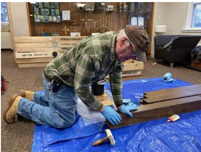
Above: Levsen Organ Company of Buffalo, Iowa completed a 20 year service of BLC's organ in 2023. The process involved dismantling and cleaning more than 1000 pipes, followed by reassembly and tuning.