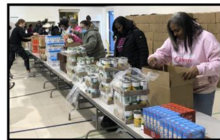
Volunteers packing the boxes

"During our conversion I asked all the questions on the Community Needs Questionnaire. Then I posed the question 'if you were to die today, are you sure you go to heaven?' She paused and said she wanted to go to heaven and her husband had been talking to her about God. I also asked her 'if she was standing before God today and He asked her, 'Why should I let you into My heaven what would you say?' She paused and said she didn't know. I asked her if she wanted to be sure right now? She said yes. I gave her the plan of salvation and her need for God. I prayed with her repeating after me, and for her assurance. She accepted Christ as her personal Lord and Savior, and I rejoiced with her and asked her if she had a Bible and told her to make sure to read it every day starting with the book of John and the Psalms and encouraged her to pray every day. I let her know she was saved, and all her sins had been forgiven. I let her know how important it was to have a church home. She said they were looking. I encouraged her to try Tabernacle Missionary Baptist Church, and see how the Lord would lead her in being a member along with her family."