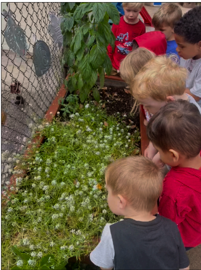
Pictured about are some of our Preschool children looking at ladybug larvae in our garden.