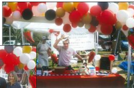
Pictures from Ecumenical Ministries Chili for Charity February 25th!