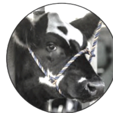
Heifer Auction Fri. 11:00 AM