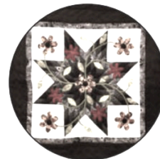
Quilt Auction Sat. 10:00 AM