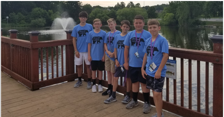
Photo of the Jr. High Youth during Jr. High youth conference in Elizabethtown Pa.