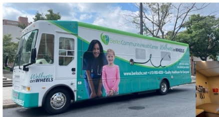
BCHC's Mobile Medical Unit

The Wellness on Wheels brings the care directly to those who need it close-by! Make an appointment for: