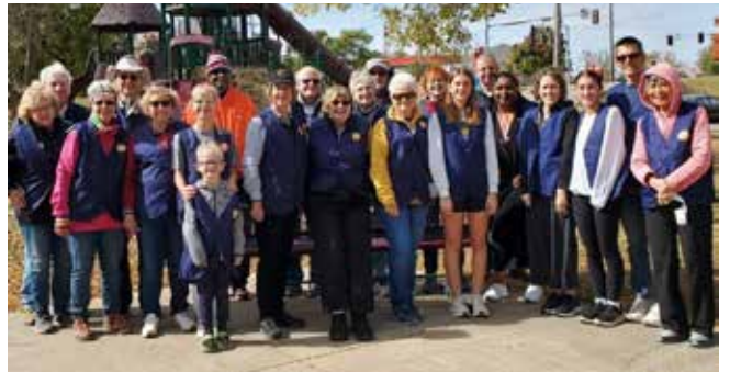
First Lutheran's 2024 hunger-fighting walkers.

Help us create a world where there is enough for all.