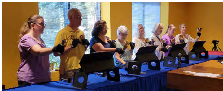
One of our Handbell Ensembles enhance our worship experience with their musical contribution.

No matter if you want to try singing, playing handbells, or connecting with the band for Contemporary or Wednesday Worship - there is a place for you! No experience required, just come to a rehearsal to get started!