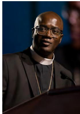
Bishop Curry addresses the churchwide assembly after his election as Presiding Bishop of the ELCA

Curry was elected on the fifth ballot. There were 799 votes cast, with 400 votes needed for an election. Curry received 562 votes, and the Rev. Kevin Strickland, bishop of the ELCA Southeastern Synod, received 237 votes. Curry is the first Black presiding bishop of the ELCA.