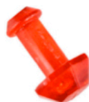
Sparky Award Plaque & Pin