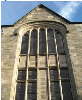
St Andrews Baptist Church Teaching Biblical Principles

The church enjoys vibrant worship in a family atmosphere and we invite all to join us in exploring what the Bible has to say to us today.