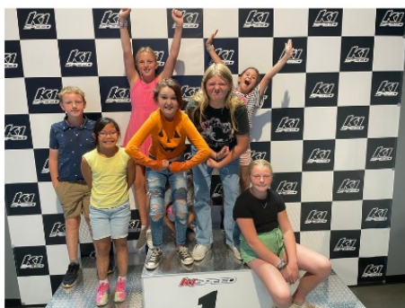
Youth Group Kick-off, Fall 2023

In everything I showed you that by working hard in this manner you must help the weak and remember the words of the Lord Jesus, that He Himself said, 'It is more blessed to give than to receive.'