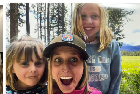
Simmons Family at Camp!