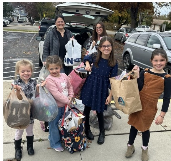
CPC delivered over 100 pairs of shoes to Frontier Elementary School.