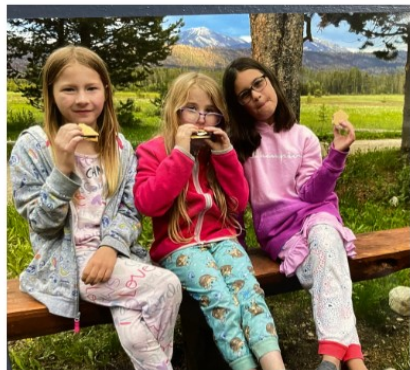
Covenant sponsored 12 CPC students to go to church camp at Luther Heights.

As we look toward 2024, we see many opportunities to strengthen our congregation and advance our mission to share God's love. Our theme for the pledge campaign this year is "Growing Covenant's Love." The theme is appropriate: we are growing in numbers, and we want to grow spiritually and in the quality and scope of the services we offer to our members and the community. A near-term strategy is to improve our programs for children in the 12-18 age group and capitalize on the strong leadership we have for younger children. More immediate goals for this year and next include building on the momentum we have created to create the best music ministry in West Boise, and continuing to support and expand our local missions (such as our help to McMillan and Frontier Elementary Schools), and even international missions (including our support of our brothers and sisters in Maji, Ethiopia).