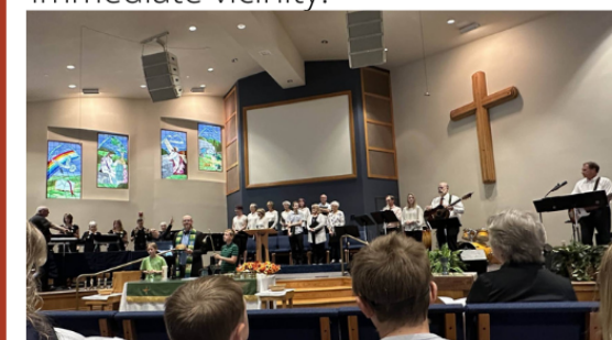
Rally Day Worship, 2023

As always, the Deacons have been working diligently to assist local families in need. We have handed out scores of food boxes, and the Deacons organized our annual backpack drive and continue to plan for a large Christmas ministry for struggling families in our immediate vicinity.