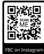
FBC on Instagram