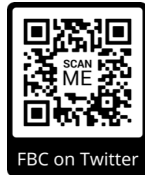
FBC on Twitter