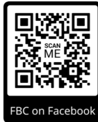
FBC on Facebook