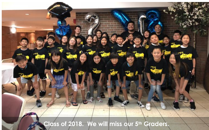
Class of 2018. We will miss our 5 th Graders.