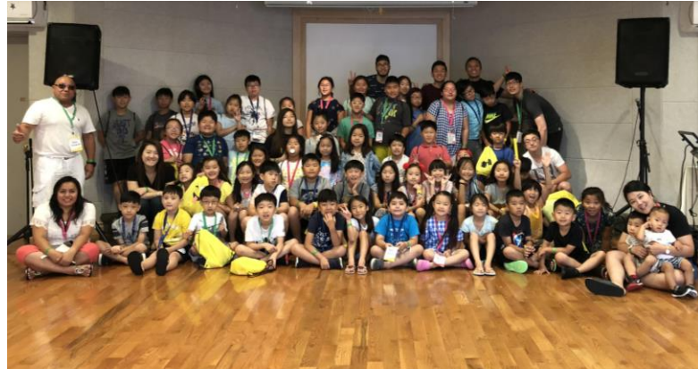
Promise Ministries - Family Retreat 2018 – Elementary School

For those families who went to Family retreat, we were so blessed and received much Holistic Healing! We thank God that we had a safe and sound trip. It was a true blessing to see families spending time together.