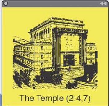
The Temple (2:4,7)

Directions Search nearby Save to... move▼