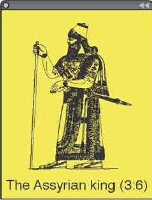
The Assyrian king (3:6)

Directions Search nearby Save to... move▼