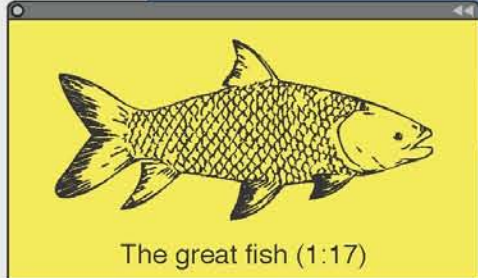
The great fish (1:17)