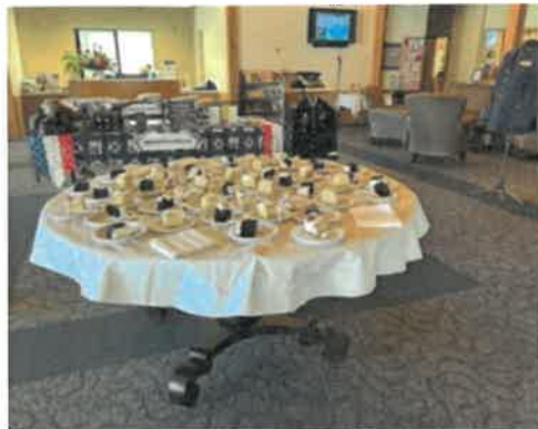
The Veterans Day cake was cut and ready to serve.