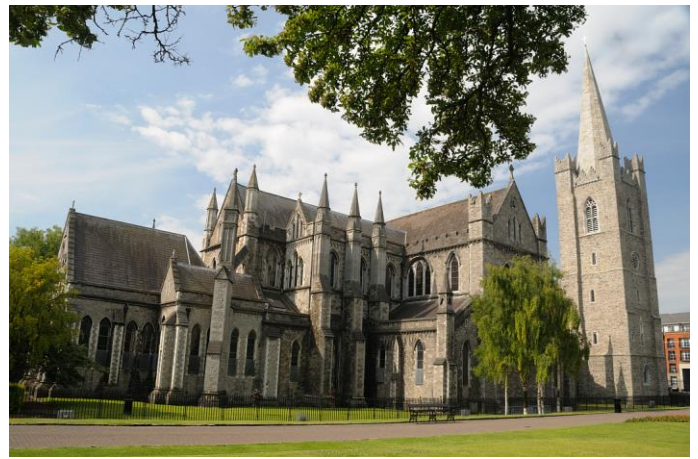
St. Patrick's Cathedral, Dublin

Arrival in Dublin and Tour Departure: This is a land only tour and begins on what is shown as “Day 1”. Travel arrangements prior to that (and after the tour) are at your own discretion. You may choose to fly in the previous day, allowing for a good night’s sleep before the pilgrimage begins and avoiding any risk of missing the tour departure due to flight delays. We can arrange accommodation for anyone who wants to arrive ahead of the tour (or stay on afterwards) and may be able to obtain preferential rates for you. Should you want to take advantage of this, it must be paid for with the March 2018 instalment. This payment is not part of your tour price and is non-refundable. The nominated hotel will be the city pick up point on Day 1.