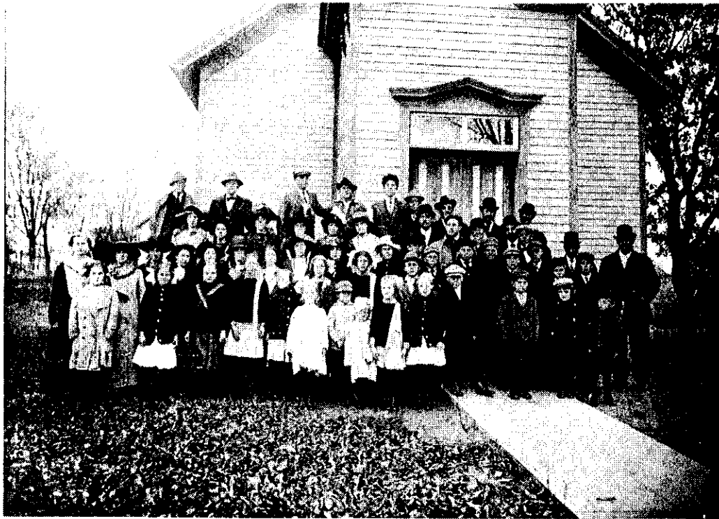
The Sauk Rapids congregation (approx. 1905)

The activities of the little group were not confined to Sauk Rapids only. As some of the members and others interested with the work lived in St. Cloud, work was started there also. Bring's stone quarry, about two miles southeast of the city, was the site for a little chapel built in 1886, where Sunday School and preaching services were conducted for a number of years. That work ceased and the building was sold in 1911. In St. Cloud proper, preaching services were conducted in an old saloon building, but in 1888 plans were laid and work started to build a church here also on 3rd Avenue Northeast. The yellow brick building was finished the following year and dedicated June 14-16, 1889, though the congregation's main meeting place continued for some years to be the Sauk Rapids location. It was cheap to build in those days. Four members are mentioned who worked on this building and were paid 15 cents per hour, besides donating six working days each. The debt on the church when finished was $106.95, though the total cost of labor and materials for the building was $900.00.