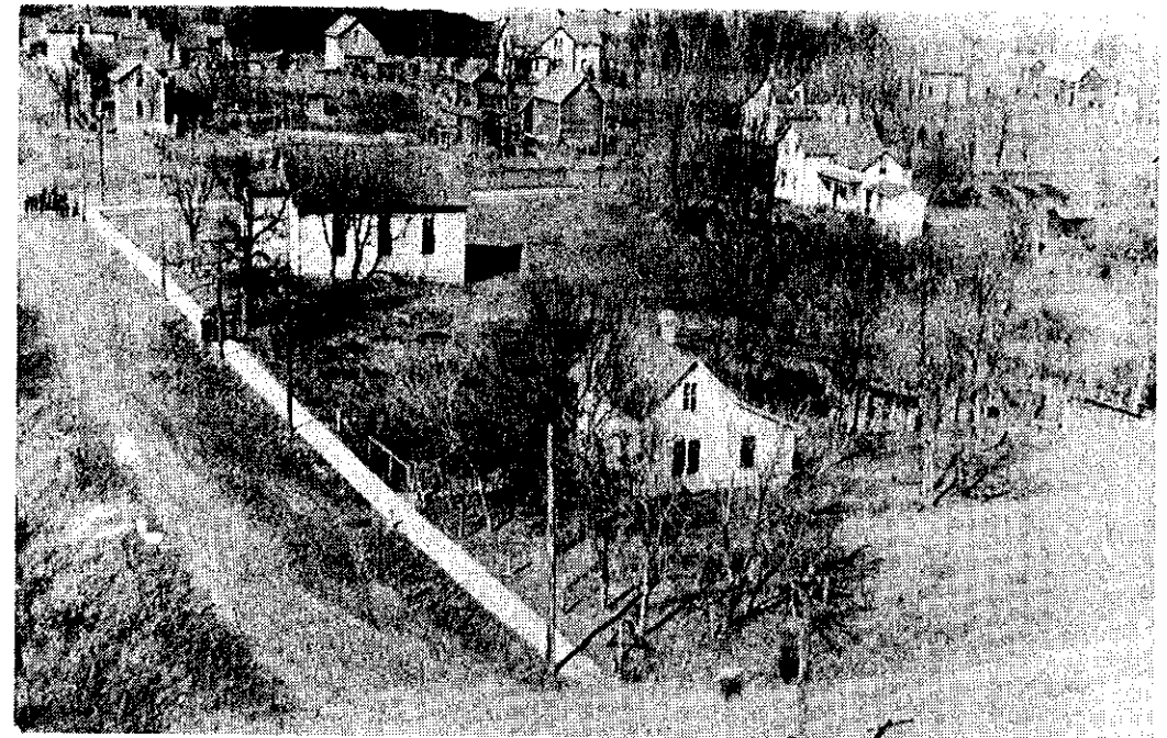
The congregation's first building, 5th Avenue and 2nd Street South, Sauk Rapids. Built in 1883 , it is the only of our former buildings still standing. (Picture taken from the Sauk Rapids water tower on Swede Hill, also still standing)

subscription started to get the necessary funds. A lot on the top of the so called "Swedish Hill" was donated by some friendly party, and on this lot was built a little church 26x36 feet. Louis Olson was given the job of building the church and was paid $2.00 a day; he was permitted to hire another man to assist him with the same pay. The building was completed in a few weeks, except for the plastering, and could be used for the services. But as there was a debt of $150.00, it was decided to use the building without plastering through the winter, and to buy the lot next to it as well. The inside of the church was finished the following year.