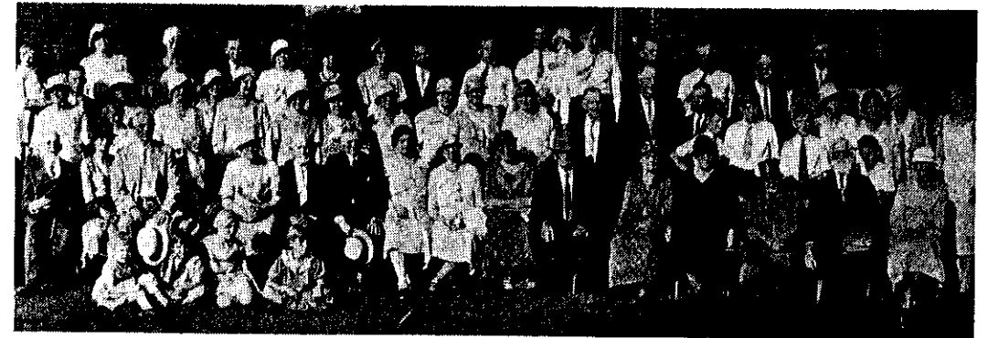
The congregation at its 50th Anniversary, June 1933

* Original picture is one long continuous photograph.