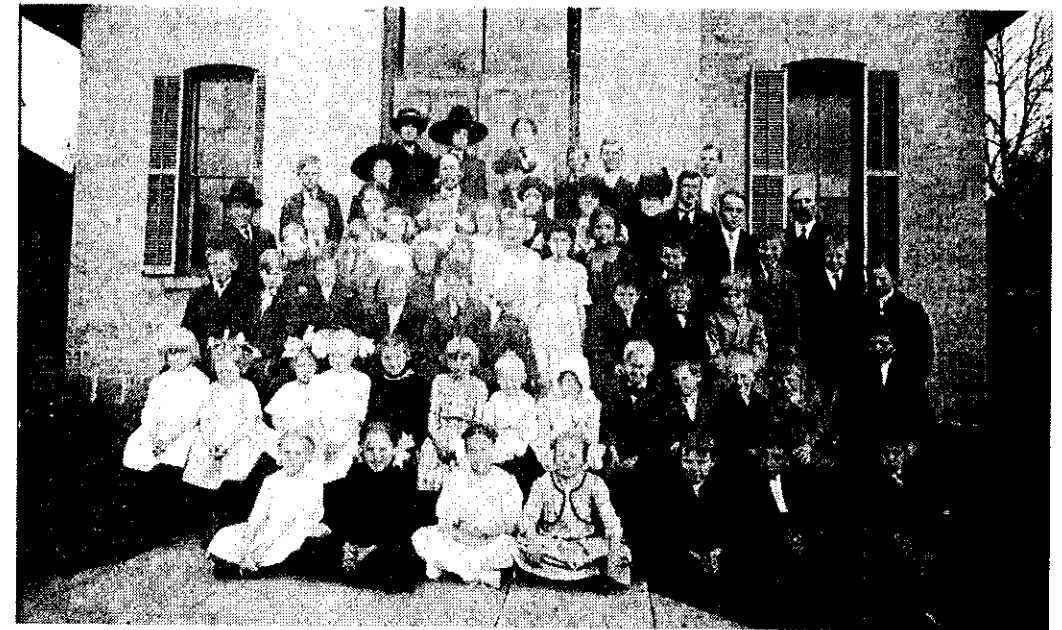
The St. Cloud congregation (approx. 1905)