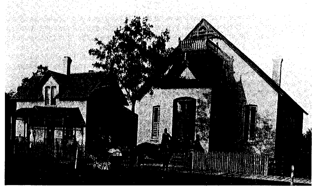
The second building, 3rd Avenue NE, St. Cloud (built 1889)

The activities of the little group were not confined to Sauk Rapids only. As some of the members and others interested with the work lived in St. Cloud, work was started there also. Bring's stone quarry, about two miles southeast of the city, was the site for a little chapel built in 1886, where Sunday School and preaching services were conducted for a number of years. That work ceased and the building was sold in 1911. In St. Cloud proper, preaching services were conducted in an old saloon building, but in 1888 plans were laid and work started to build a church here also on 3rd Avenue Northeast. The yellow brick building was finished the following year and dedicated June 14-16, 1889, though the congregation's main meeting place continued for some years to be the Sauk Rapids location. It was cheap to build in those days. Four members are mentioned who worked on this building and were paid 15 cents per hour, besides donating six working days each. The debt on the church when finished was $106.95, though the total cost of labor and materials for the building was $900.00.