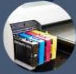
Ink & Toner