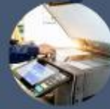
Print, Promo & Apparel