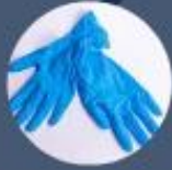
Cleaning & Facilities