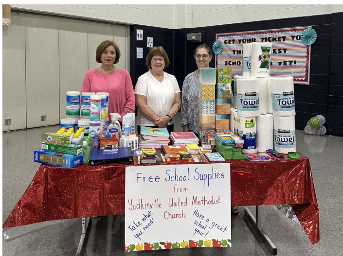
Thursday: Fill and Clean the bus items donated for Teachers were set up at YES.

Thanks to church members for all the donations of school supplies, cleaning supplies, breakfast items, and of their time for the teachers and staff at Yadkinville School. The teachers and staff are greatly appreciative of all our support as they begin a new school year!