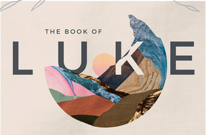
Luke 2: The Boy Named Jesus

Check in at Children's Desk in lobby upon arrival. Nursery available for 0-3 years the entire service. PreK-5 th graders dismissed after Worship Songs. Take child to pick up from the classrooms in Bldg. 2.