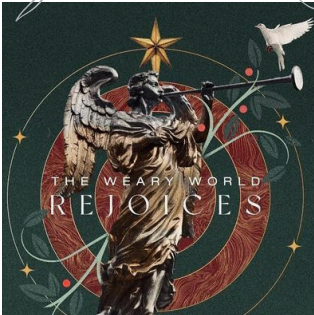
Luke 2: Born Savior of the World

Check in at Children's Desk in lobby upon arrival. Nursery available for 0-3 years the entire service. PreK-5 th graders dismissed after Worship Songs. Take child to pick up from the classrooms in Bldg. 2.