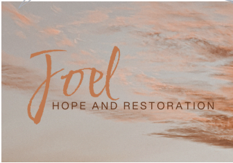
Joel 3: Revenge and Restore

Check in at Children's Desk in lobby upon arrival. Nursery available for 0-3 years the entire service. PreK-5 th graders dismissed after Worship Songs. Take child to pick up from the classrooms in Bldg. 2.