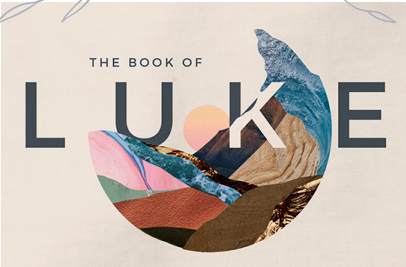
Luke 5: Jesus, Peter and Fish

Check in at Children's Desk in lobby upon arrival. Nursery available for 0-3 years the entire service. PreK-5 th graders dismissed after Worship Songs. Take child to pick up from the classrooms in Bldg. 2.