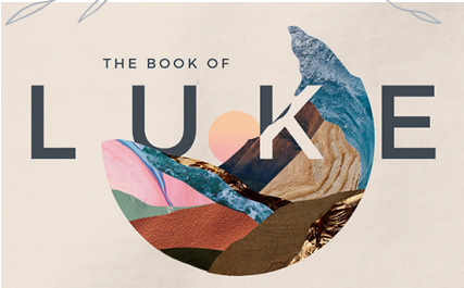
Luke 4: Jesus Performing Miracles

Check in at Children's Desk in lobby upon arrival. Nursery available for 0-3 years the entire service. PreK-5 th graders dismissed after Worship Songs. Take child to pick up from the classrooms in Bldg. 2.