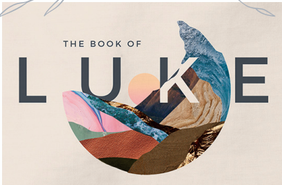
Luke 4: Jesus at the Synagogue

Check in at Children's Desk in lobby upon arrival. Nursery available for 0-3 years the entire service. PreK-5 th graders dismissed after Worship Songs. Take child to pick up from the classrooms in Bldg. 2.