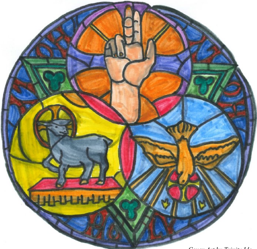
Cover Art by Trinity Ide

7940 Rocky River Road Concord, NC 28025 704-455-2479