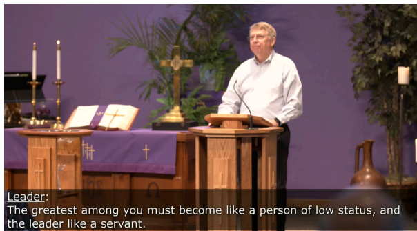
Leader: The greatest among you must become like a person of low status, and the leader like a servant.

Urgency: Urgent need to fill this role to ensure our church's voice is heard and represented in the broader United Methodist community, fostering unity and spiritual discernment in our decision-making processes.