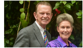
PERSONAL: SEASONS OF LIFE