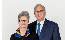
THE BUCKLANDS REGIONAL DIRECTOR