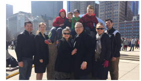
PERSONAL: THEIR FAMILY