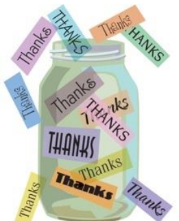
Overflowing With Thanks