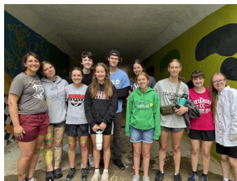
C of C NW painted over graffiti