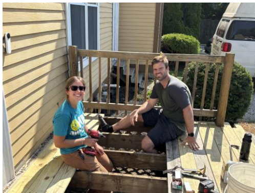
New Deck at CSF