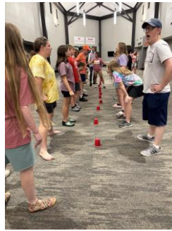
Sunday Night Games