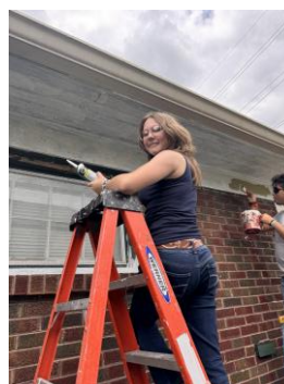
Painting at ECDC