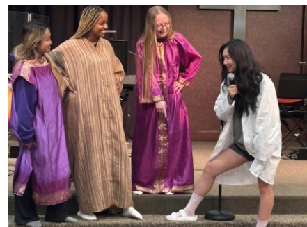
Power-Up Skit was Hilarious & Taught the Theme