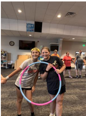
Power Up Games

We were hosted by New Hope Christian Church in Whitestown. Christ's Church from Flora, IL joined us for a great first week. Part of the group led a Sports Camp & VBS in partnership with Old Southside Church and the other part did interior demolition at Victory in the City.