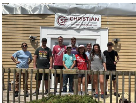
Campus House New Look