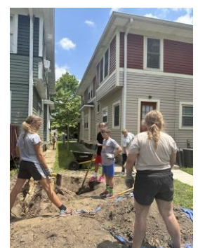
Part of Cornerstone worked to provide good drainage