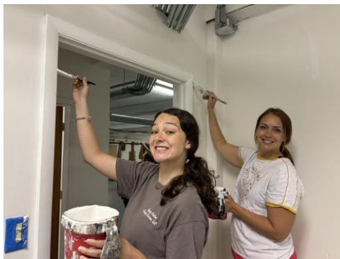
Mom & Daughter Paint Crew