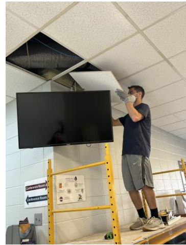
Ceiling Tiles at Chapel Hill UMC