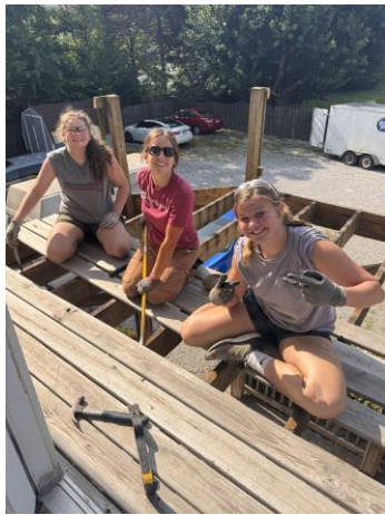
Removing Old Deck