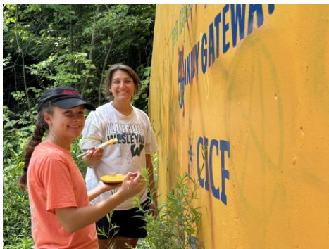
B & O Trail Tunnel Repainted and Graffiti Removed