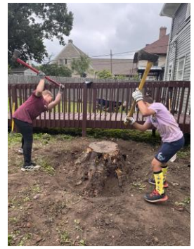
Working on a Stump