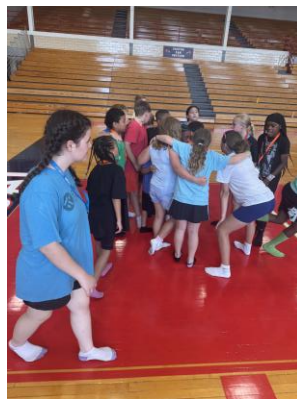
Sports Camp Fun