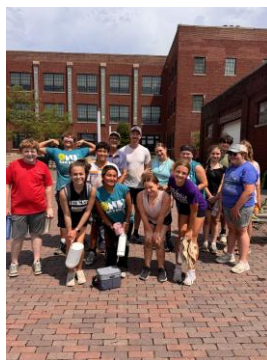
Purdue Poly H.S.