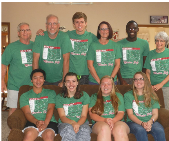
Summer Interns & Staff