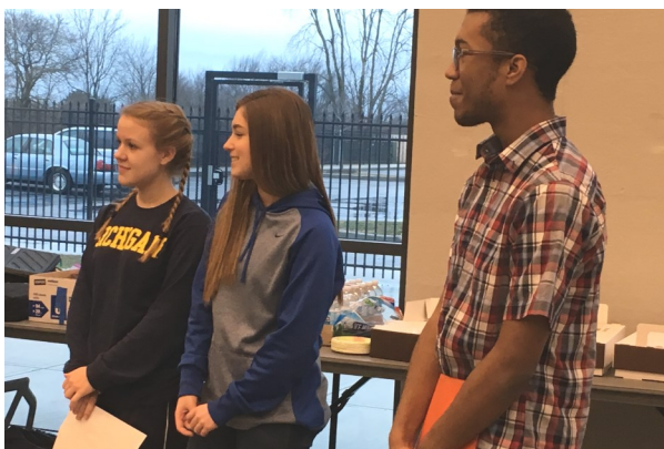
Interns from Trader's Point Academy—J-Term