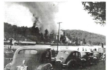
Campground Fire 1945 Curtis Hildner

7:00 pm—Video of the 1945 Fire and other stories of our past Presented in the Youth Center