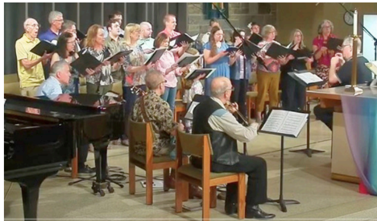
Pictured above: Sanctuary Choir Rehearsing for Bluegrass Sunday 2025