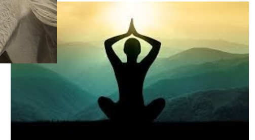
"Family Values" Mark 10:13-31