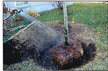
Watering the tree

4. FINISHING TOUCHES: Soak the root ball with water. Check the tree planting once a week for the first month and water as necessary.