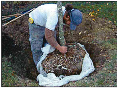
Removing wrapping from a root ball