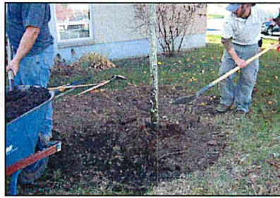
Backfill root ball in layers with rich soil.