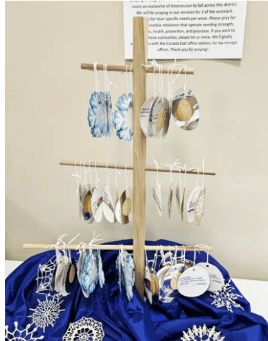
CWD missions' outreaches were prayed for daily with specific needs and with thankful hearts as to all our Church district carries out.