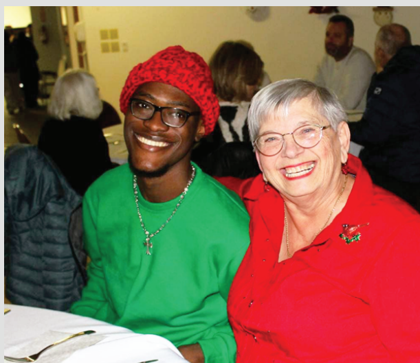
January 6th Christmas/Epiphany party