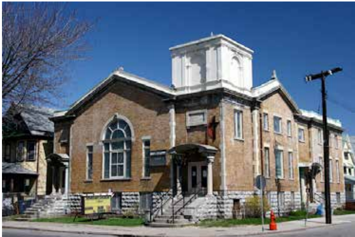
Seneca Street United Methodist Church in Buffalo, NY

Please place your donated items in the basket outside Rev. C. Kay Fuino's office (located on the 1 st floor of the Family Life Center) or in the box located inside the front doors of the Sanctuary.