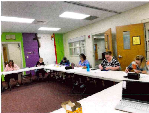
Women’s Bible Study Group

Thank you for the many ways you love and care for our college students!