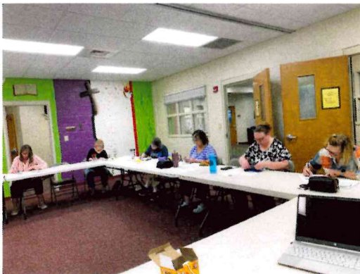
Women’s Bible Study Group

Thank you for the many ways you love and care for our college students!