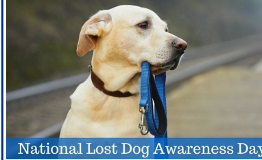
National Lost Dog Awareness Day