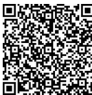
Scan to Give