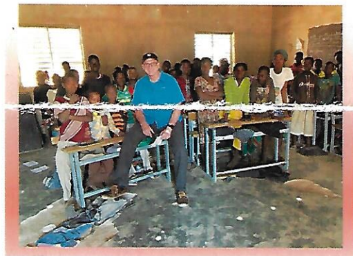
COH is on the ground in Africa, working to keep every child healthy and happy. We do this by working with the most vulnerable to make sure they have one nutritious meal a day.