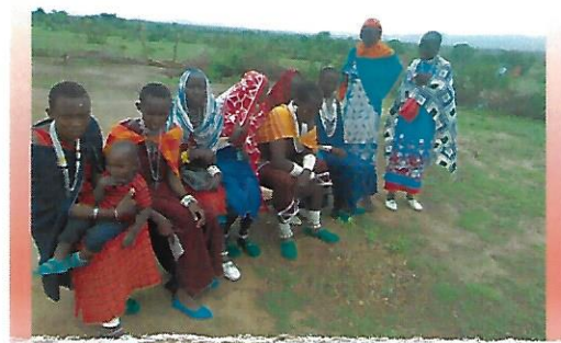
To make the feeding programs sustainable, COH works with mothers to provide health, nutritional and entrepreneur training.