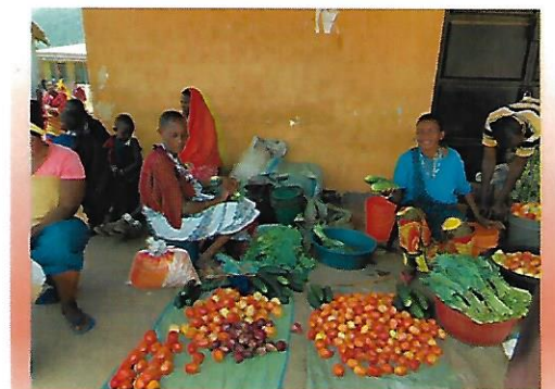
Lastly, at COH our mission is to help promote agricultural beyond the current level of subsistence to a level of commerce and improving health of communities.