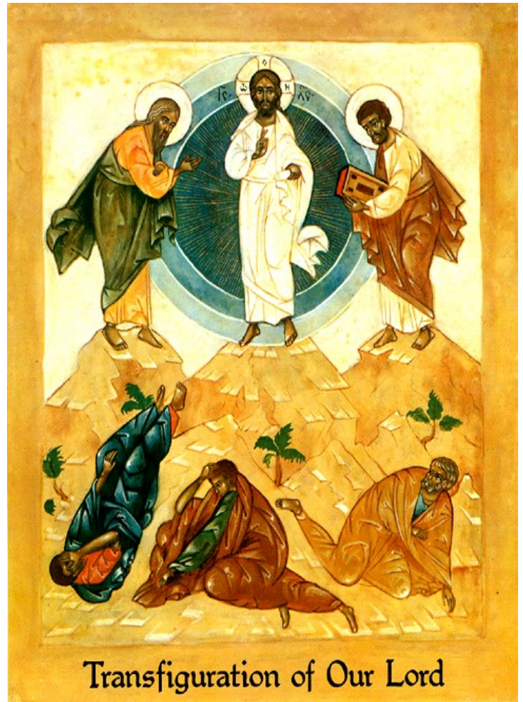
Transfiguration of Our Lord

OUR MISSION: We the Faith Community of St. Brigid Catholic Church declare our mission is to know and imitate Jesus. We proclaim the reign of God in this community by preaching, teaching the Good News and celebrating our Roman Catholic worship. We witness the faith by demonstrating service and compassion for those in need. As Community, we welcome, honor and respect all people with the special emphasis on the culture and heritage of the African American and Hispanic Catholics.